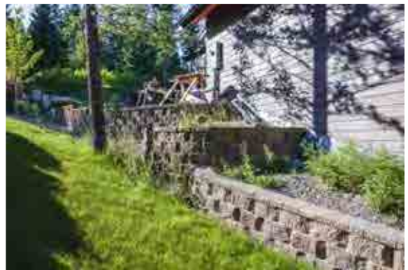
Stepped retaining wall to cover exposed foundation.