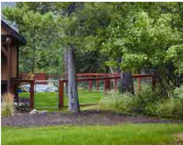
Example of acceptable height, style and materials for dog run.