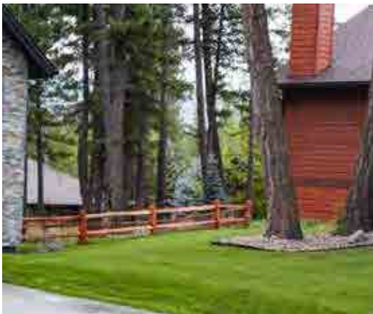
Example of acceptable height, style and materials.

10.10.5. An onsite review with the homeowner and the ARB is required prior to approval.