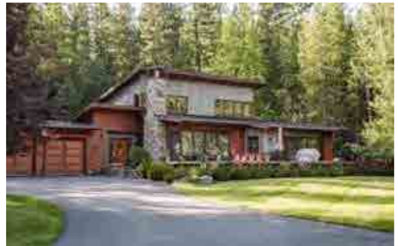
Modern style home with mono slope (shed) roof and combination of wood, metal and stone.