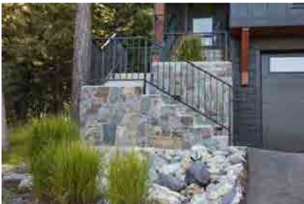
Stone cladding over concrete.