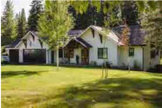
White and black color palette with timber accents.