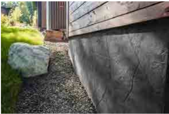
Textured architectural finish over concrete foundation.