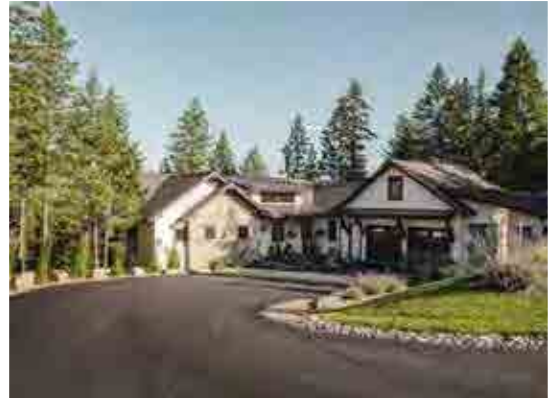
Transitional style home with gabled rooflines, shed dormer and wall masses showing architectural relief.