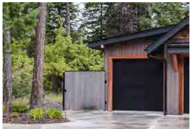
Example of gate with acceptable style and materials.