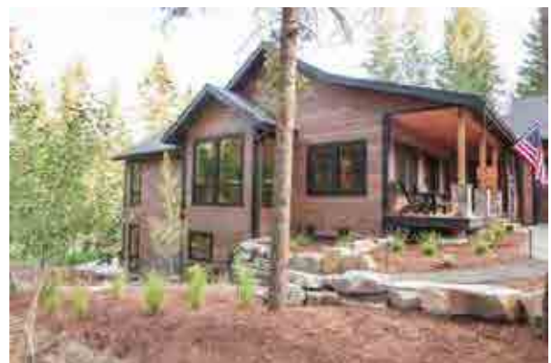
Stepped retaining wall to cover foundation.