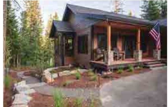
Transitional style home with combination of wood and stone. Large stones used for landscaping and retaining walls.