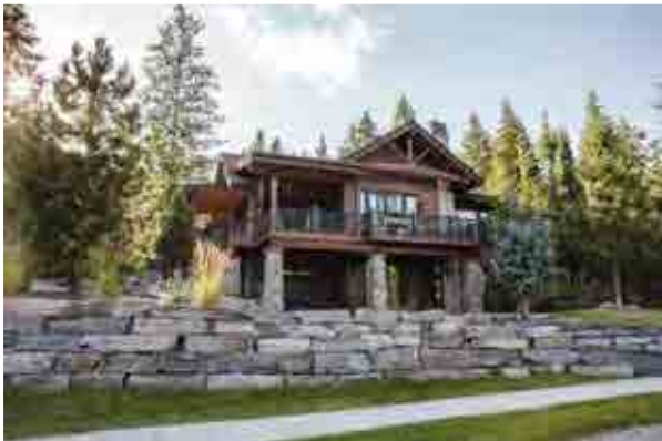
Transitional style home with combination of wood and stone with stacked stone retaining wall.