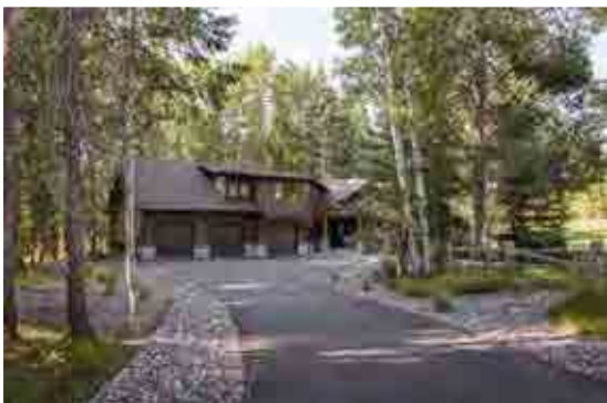
Transitional style home with combination of wood and stone.